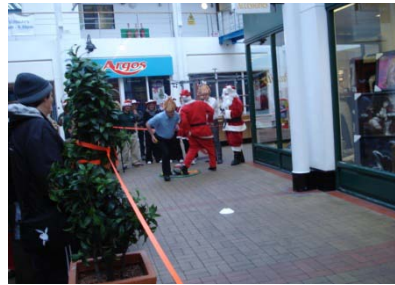
Photo's of Mayors Appeal